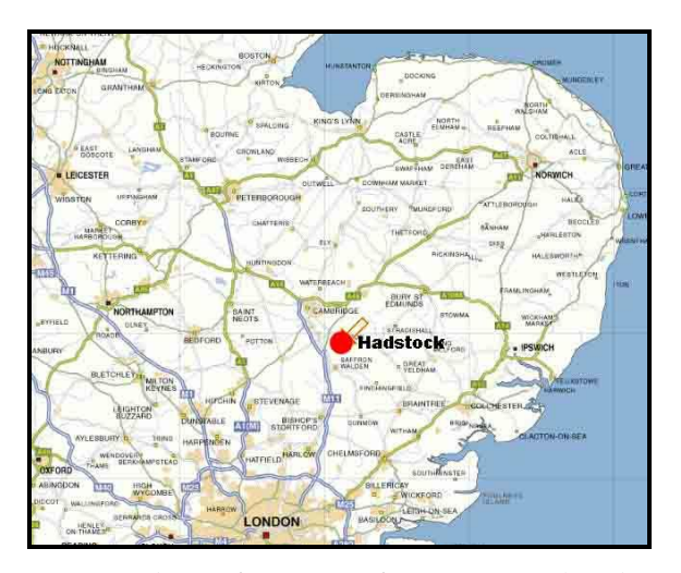
Approach: If coming from A11, take the A1307 to Linton and turn right onto the B1052. After passing the King's Head Pub on your right (excellent 'ham egg and chips' in March 2013), do not turn up Walden Road but drive straight over and find the narrow lane (see dotted red line on map below) and proceed to the church car park.

Key: The church is open daily but in case of difficulties ask anyone in the village for Robin Betser (who is the Churchwarden and lives close by).